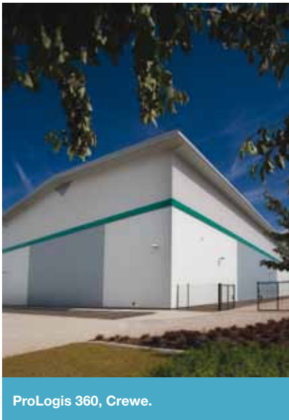
ProLogis 360, Crewe.